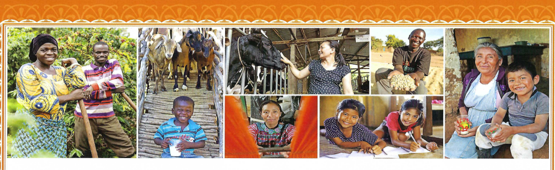
Heifer International gratefully recognizes

This letter will serve as acknowledgement of your gift. No goods or services were issued in exchange f