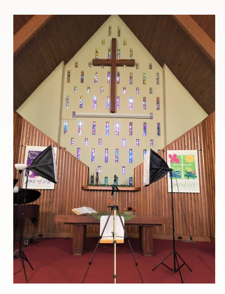
CCC recording studio

We have changed direction over that past month and have made the decision to hold a at home/virtual VBS this summer. The dates will remain from July 13th to July 17th. More details will be available in the next couple of weeks to help us with our planning for this unique VBS experience.