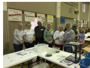
Assembly of nutrition bags for Feed My Starving Children