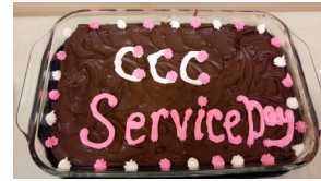
Cake decorating for the evening meal celebration