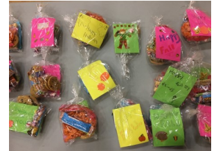
Cards and snacks for CCC friends