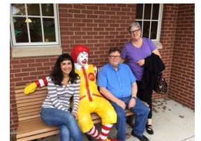
Relaxing while food is cooking for guests at Ronald McDonald House.