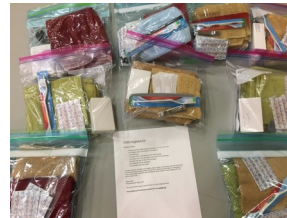
Hygiene kits for Church World Service