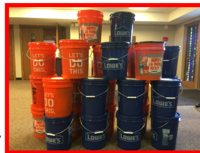
Your donations helped us fill over 25 buckets.

for the sign up to help with this mission, or contact Wendy Finch or Tracey Hammack.